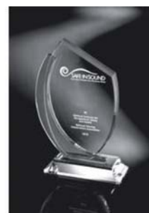
Figure 1. Safe-in-Sound logo and crystal award.